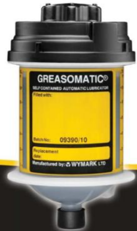
Single-Point Automatic Lubricator